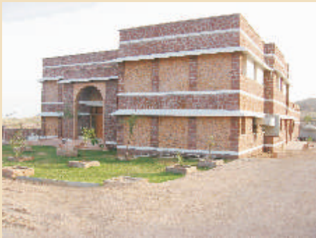
Rajasthan Programme Office