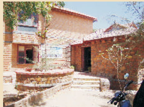
Rural Training Centre