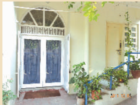
Gujarat Programme Office