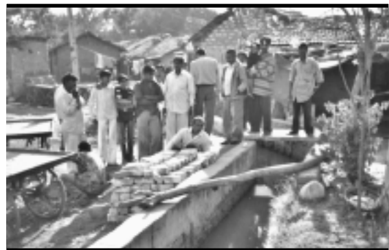
Community monitoring of water and sanitation

Besides working closely with select small towns, we also organised educational events for municipal staff and elected representatives. On May 19, 2004 a consultation was held inviting academicians, officials from Gujarat Urban Development