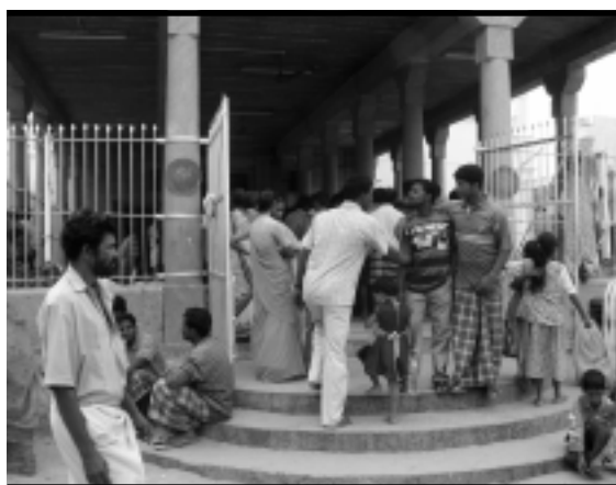
Tsunami relief camp at Nagercroil

This is the 16 th annual report of UNNATI. We continuously examine our relevance and identity, and writing the annual report provides us with the opportunity to do so. As we have mentioned in the last two annual reports, UNNATI has made a strategic shift from a support organisation to an issue-based, strategic educational institution. In this report we once again emphasise the thrust of our current programmes. UNNATI is committed to the fight against social exclusion and discrimination, and in the promotion of decentralised and accountable governance which is critical for sustainable development. We work directly at the field level and synthesise grassroots experiences for knowledge building, capacity building and advocacy. All initiatives are executed in a framework of collaboration and partnership in which each partner brings distinctive value and strength. Currently, we are working on fighting discrimination against the dalits, mainstreaming gender and disability, promotion of community-based disaster preparedness and strengthening local governance in rural and urban areas in Gujarat and Western Rajasthan.