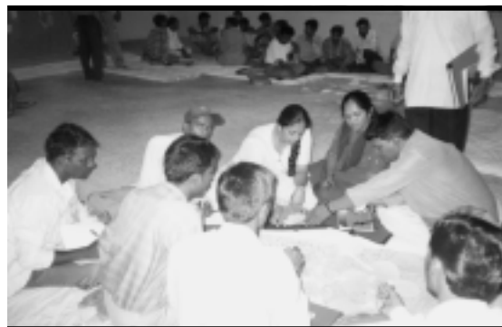
Training of citizen leaders

drinking water supply and sanitation) and developmental programmes and bring the issues before the panchayats, municipality, administration and gram sabha for appropriate action. The women leaders have formed block level associations and have been working to support elected women representatives in taking up development issues, particularly related to women and children. Around International Women's day, block and district level sammelans of elected women panchayat representatives and citizen leaders were organised. In Gujarat, a Bhavai (a form of folk drama) was performed on the issue of violence against women.