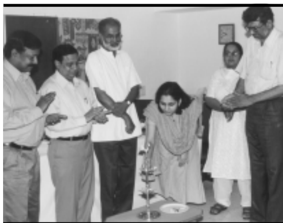
TOT on gender mainstreaming

To mainstream gender in development programmes, a thematic focal point has been created in UNNATI. An organisational 'Gender Policy' has been formulated and has also been approved by the Executive Committee. Gender audits were conducted following which gender policies have been developed for four partner organisations in Rajasthan. In Gujarat, a two-phased training of trainers (April 26-30, 2004 and June 21-25, 2004) was organised on 'Gender Mainstreaming', in collaboration with the Gender Resource Centre (GRC) of the Women and Child Development Department (GOG) and United