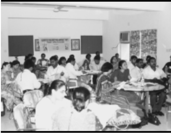
TOT on gender mainstreaming

Nations Population Fund (UNFPA). Twenty eight (28) participants from government departments, NGO representatives and independent resource persons participated in this programme. The aim was to create a cadre of resource persons at the district level to provide training support to various development programmes. The report of the training programme has been published by the GRC in English and Gujarati.