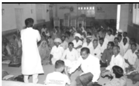
Training of panchayat resource group

In Gujarat, in Sabarkantha and Ahmedabad districts, a group of citizen educators have been identified in both urban and rural areas and trained to work on promotion of citizen leaders. The citizen leaders facilitate the process of gram sabha mobilisation, monitor basic services (mid-day meal, anganwadi,