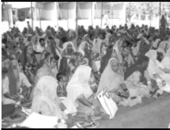
Womens' day celebration

representatives on basic administrative and development features of the Act. A set of popular educational material directly relevant to panchayat functioning was provided to all the participants. After the first round of the one-day orientation programmes, the women elected representatives were invited to celebrate women's day which was organised on March 14, 2005 at Jodhpur. More than 400 women elected representatives from all the 3 tiers participated. In this programme, discussions were held on the status of women, female feticide, domestic violence and laws on gender justice. The Government of Rajasthan, through Indira Gandhi Panchayati Raj and Grameen Vikas Sansthan (IGPRS), had planned a statewide training programme. Resource persons from UNNATI participated as master trainers for coordination of district level training programmes.