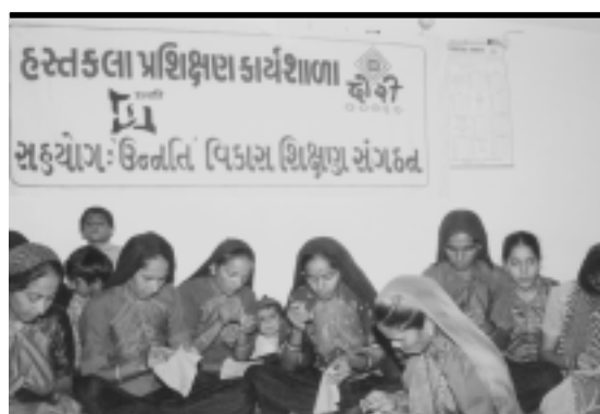
Skill grading workshop with women artisans

to 8 different exhibitions to directly interact with the buyers as well as get insight on the pricing of products. 178 women have undertaken insurance for all members of their households as well as for their productive assets. Several workshops were also organised on the theme of group building, micro-finance and women's reproductive health during the year.