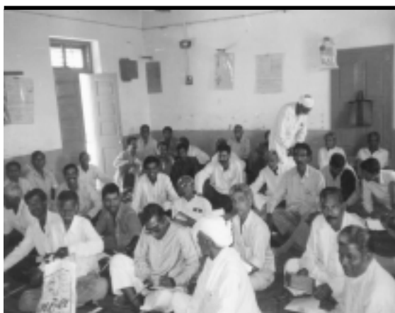
Meeting with Social Justice Committees

The new Ministry of Panchayati Raj has provided renewed thrust to the devolution process. The seven round table conferences organised by the Hon'ble Minister inviting the State governments arrived at many important resolutions. In order to arrive at the Gujarat State level follow up action plan of the round tables, a meeting was convened (February 7, 2005) in the presence of the Minister of Panchayati Raj (GOG), Additional Secretary, Ministry of Panchayati Raj (GOI), Principal Secretary and Commissioner Department of Panchayati Raj (GOG), NGO representatives and panchayat representatives.