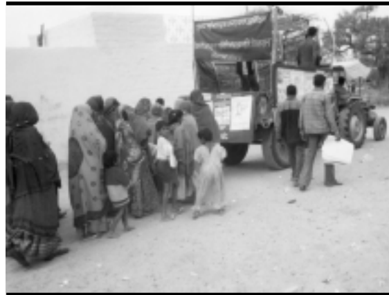
Pre-election voters awareness campaign

UNNATI has been working on strengthening local governance, particularly on Panchayati Raj Institutions (PRIs) since 1994. We have realised that citizen's participation in