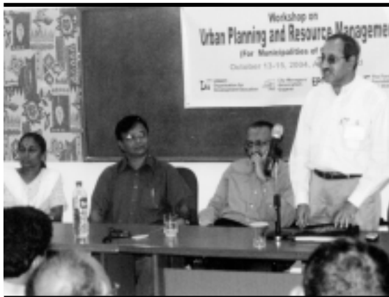
Training of municipal officials and elected members

Company, Directorate of Municipalities, representatives of Asian Development Bank and town planners where it was suggested that our training programmes should include themes like poverty analysis, public-private partnership, infrastructure development particularly for informal settlements, project formulation, resource mobilisation, leadership development and motivation. In collaboration with City Managers' Association, Gujarat and Environmental Planning Collaborative a manual was