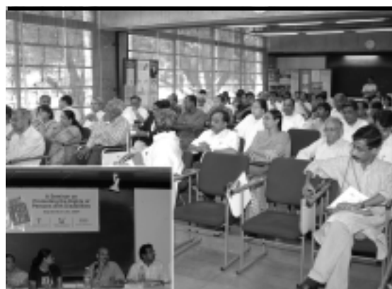
Workshop on legal provisions for persons with disabilities

A multi stakeholder partnership programme was developed in partnership with Handicap