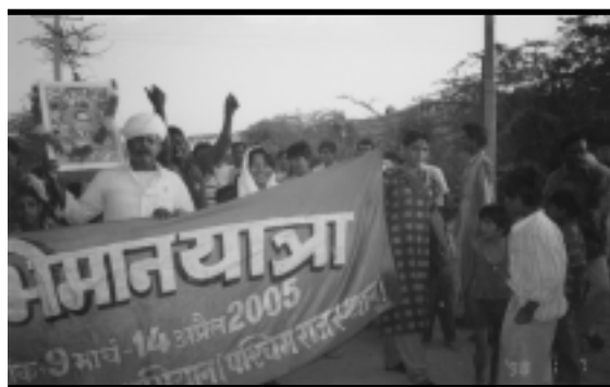
The swabhiman yatra

The dalit mobilising and organising is being coordinated through 9 dalit resource centres (DRCs) set up at the block and cluster level and these are facilitated by local NGOs. The DRCs convene village and block level meetings and facilitate the process of