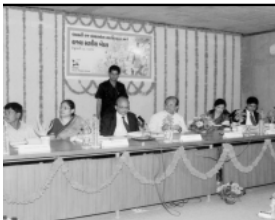
Follow up meeting of the Round Table Conference