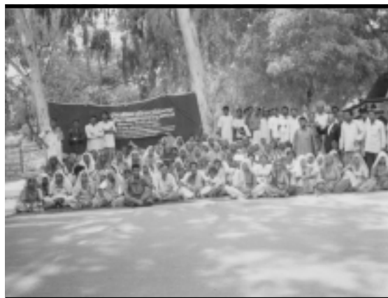
Demonstration by dalit adhikar abhiyan

resolving cases of discrimination, atrocities and other development issues. A study has been initiated for a traditional migrant community ( Kalbeliyas ) on the issues of their access to ration cards, housing, land title, voting rights and caste certification. To raise these issues, dharnas and demonstrations were organised by the DRCs.