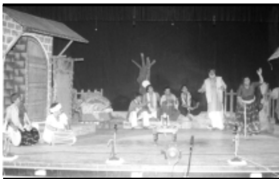
Performance of a play 'Dungro Dolyo'

Theatre activists have been supported to produce and stage theatre on the themes of violence against women and peace building. The Ahmedabad Theatre Group (ATG) was supported to produce a short play (Akhbar Kehta Hai) and staged six shows in different parts of Gujarat. The group has staged shows for Oxfam for their campaign on violence against women. In one of the events, on World Theatre Day, the group performed theatre songs on contemporary social issues.