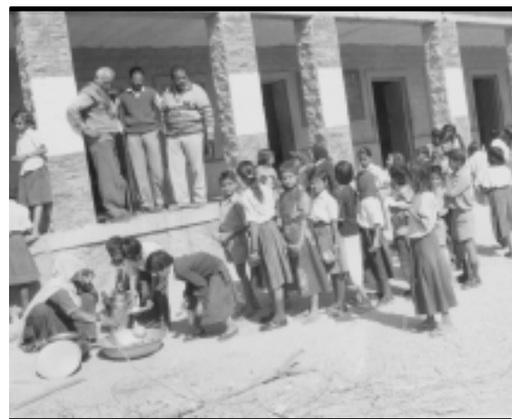
Monitoring mid-day meal scheme

In both Gujarat and Rajasthan, panchayat resource centres (PRCs) have been set up (6